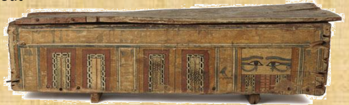
Coffin of Nakht 1923.33.a.1 CC Glasgow Museums

The rectangles on the side of this coffin represent the arches on a mud brick tomb.