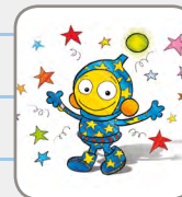
Ziggy the Alien