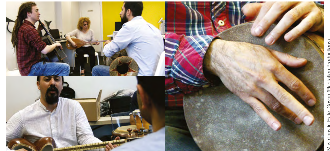
Musicians in Exile, Govan (Plantation Productions)