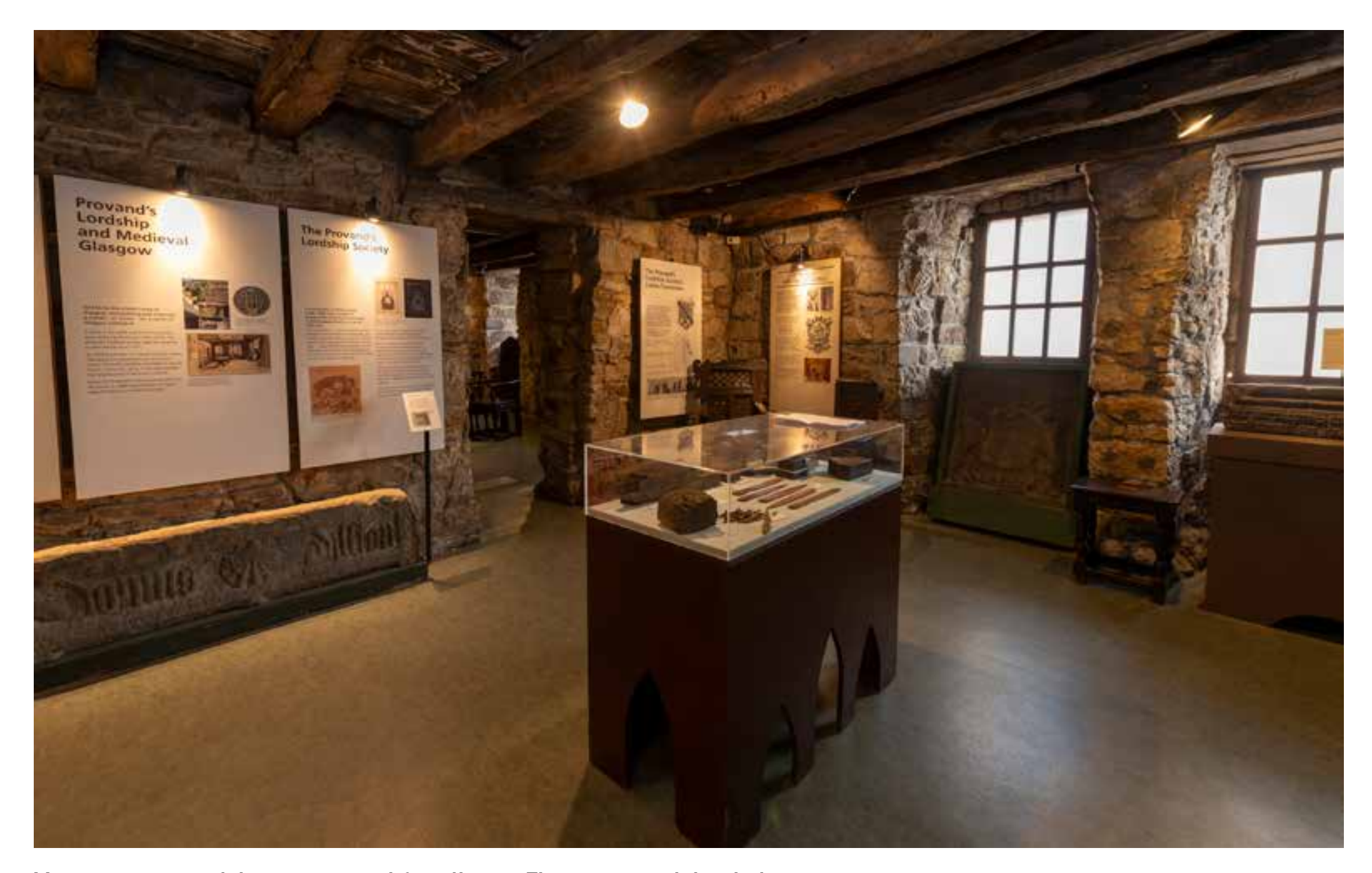
You can see old rooms and furniture. There are objects in cases.