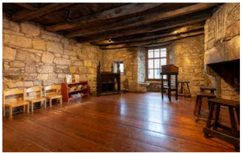
This is upstairs. There is a life-size model of a man sitting in a chair. There are paintings on the walls and places to sit. Children can do activity sheets here.