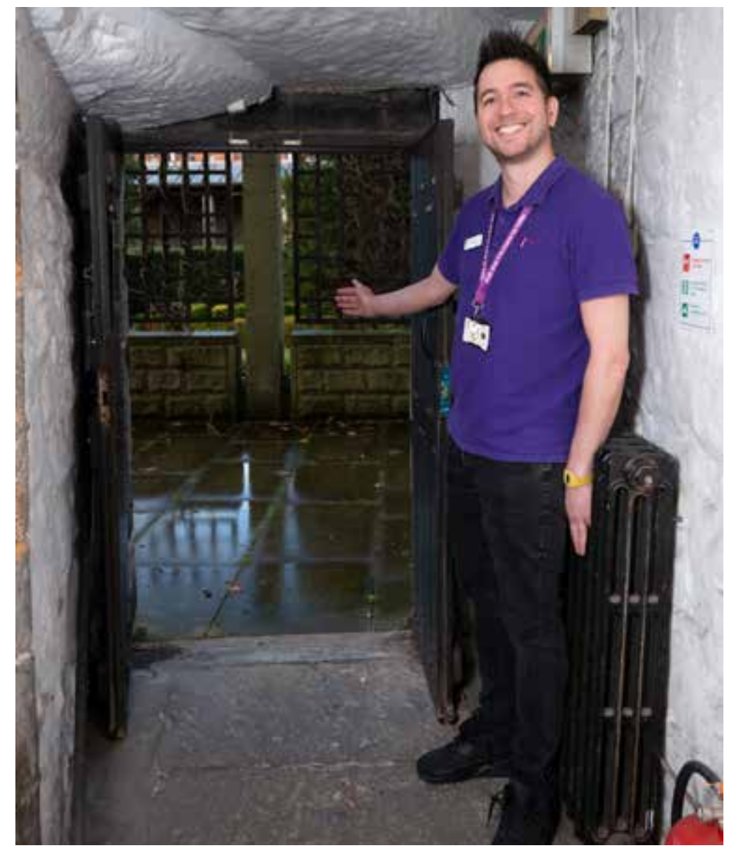
There is a small low door out to St Nicholas Garden.

Staff can open a larger wheelchair-accessible door if needed.