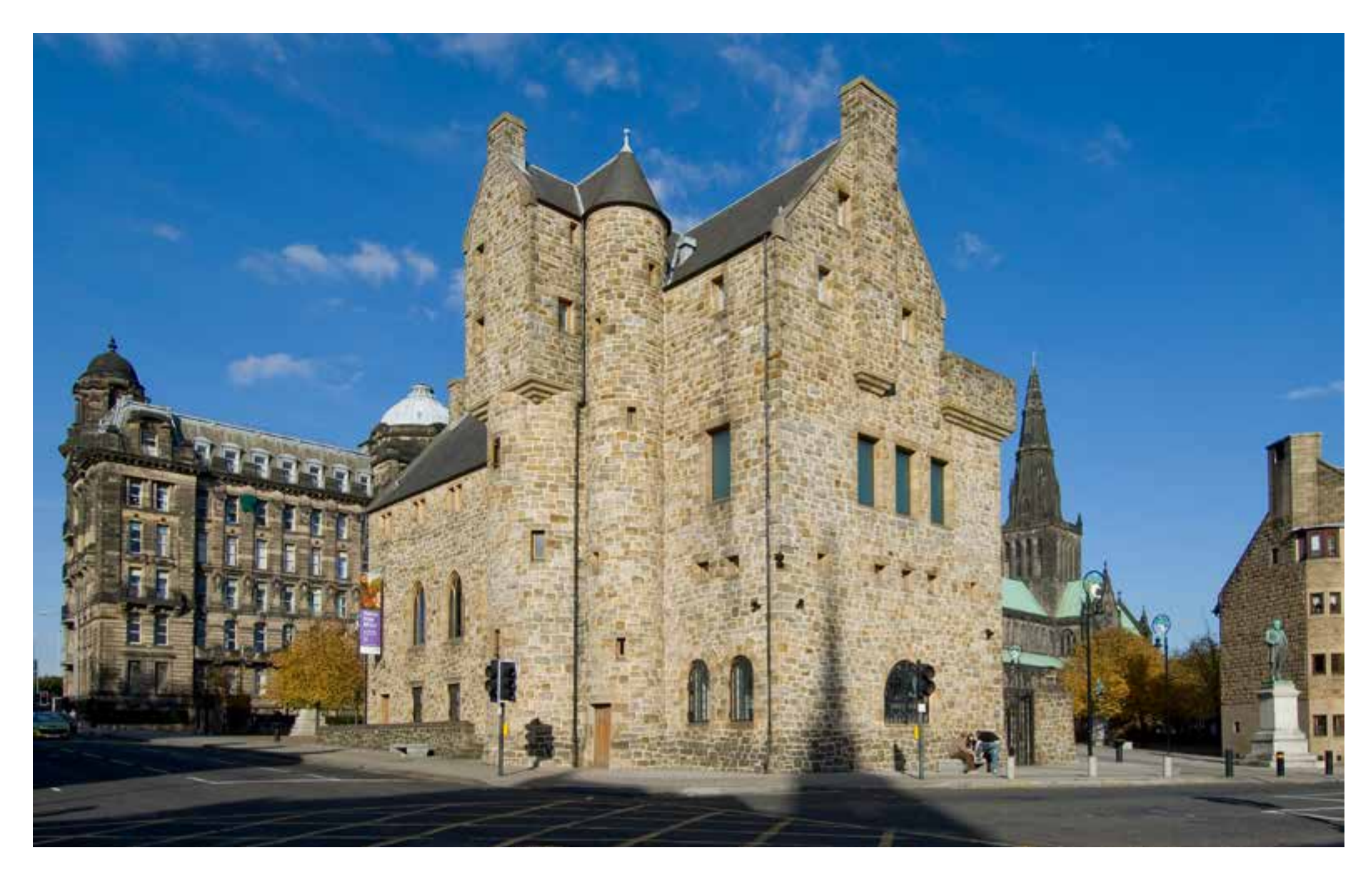
There are toilets across the road in St Mungo Museum of Religious Life and Art.