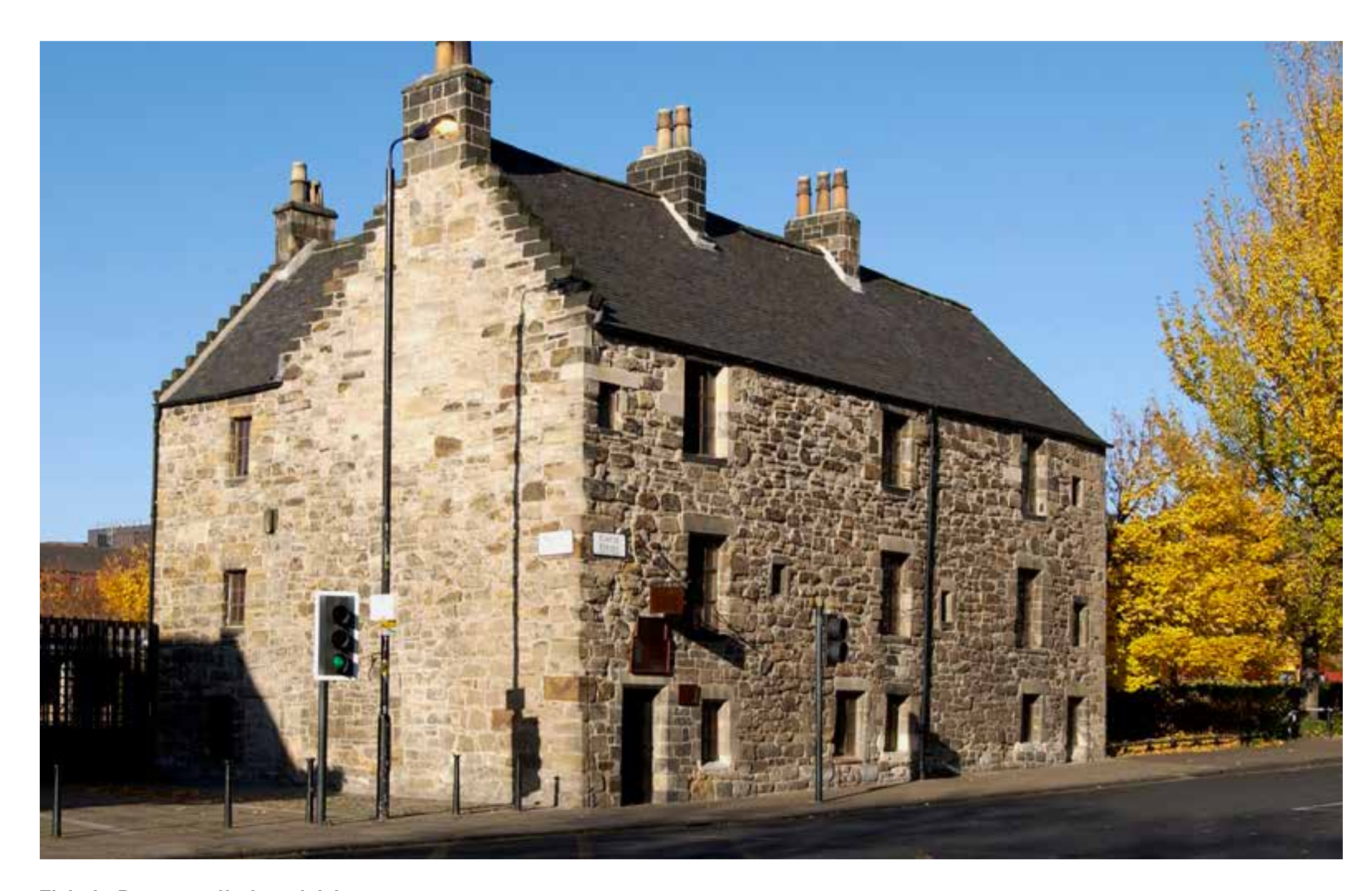
This is Provand's Lordship.