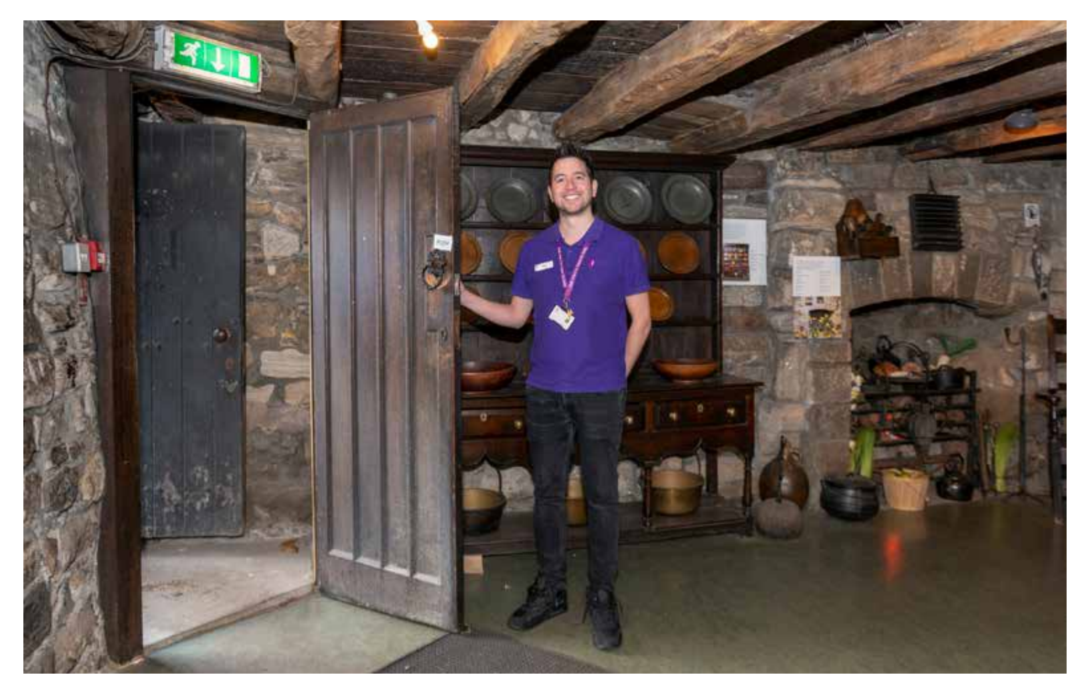
Come and have a look inside. A gallery assistant can help you if you ask.