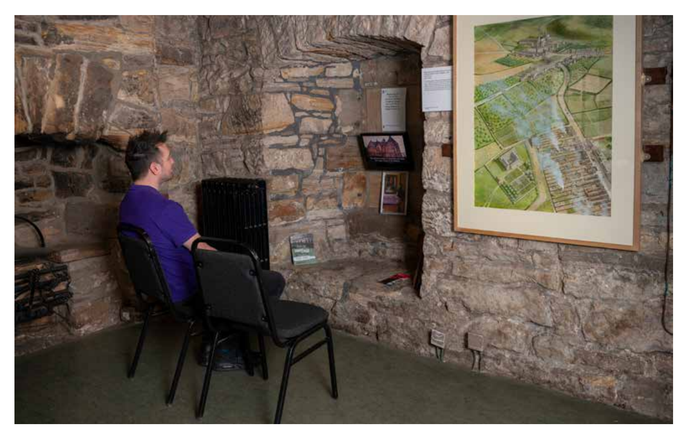
You can sit and watch a video about the rooms upstairs.