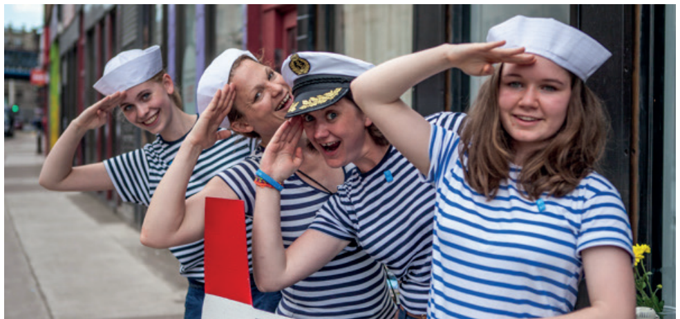
Image: Great Gaelic Ferries, Commonwealth Games, International State of Happiness

Aiseagan Mòra Gàidhlig, Geamannan a' Cho-fhlaitheis, Stàt Neo-eisimeileach Sonais