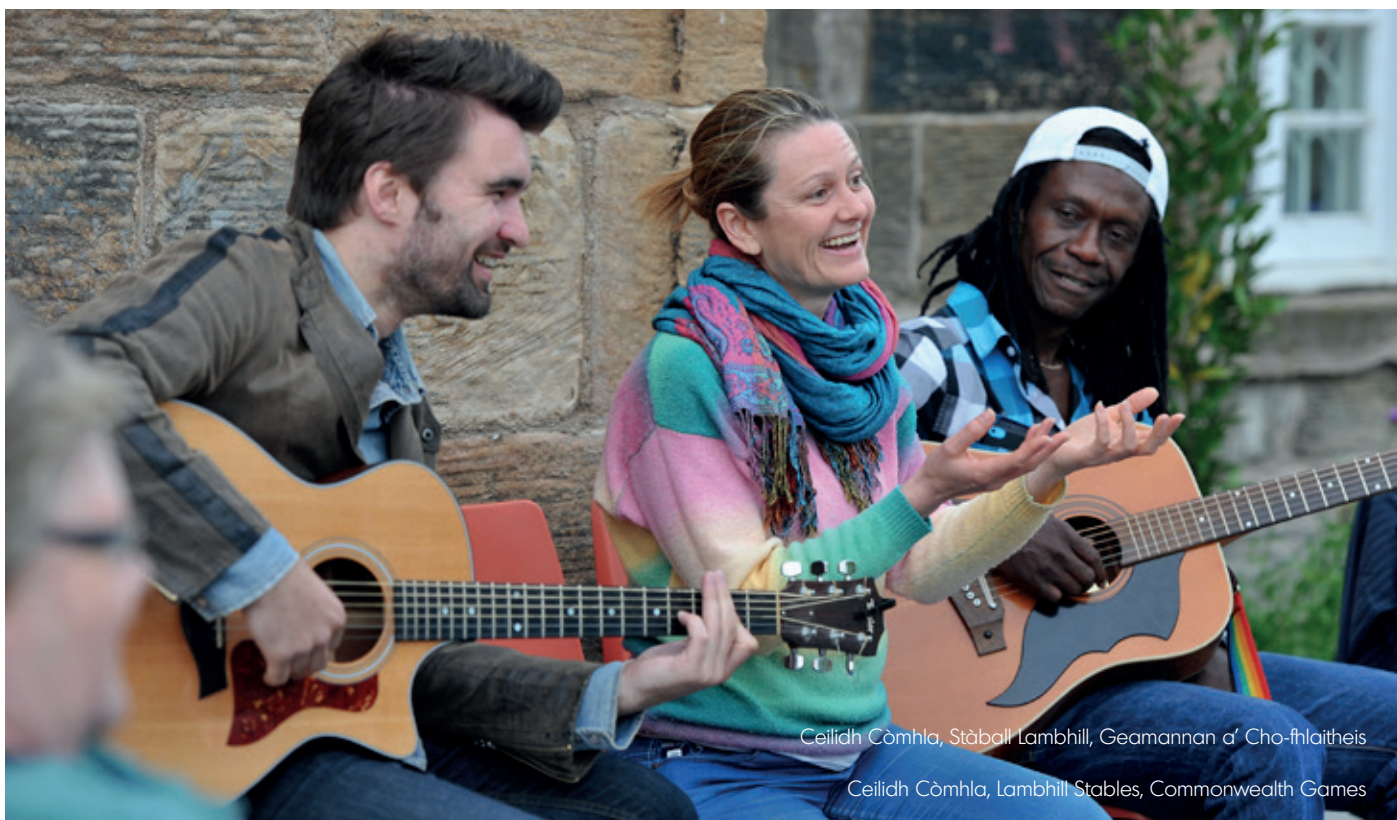
Ceilidh Còmhla, Stàball Lambhill, Geamannan a' Cho-fhlaitheis Ceilidh Còmhla, Lambhill Stables, Commonwealth Games