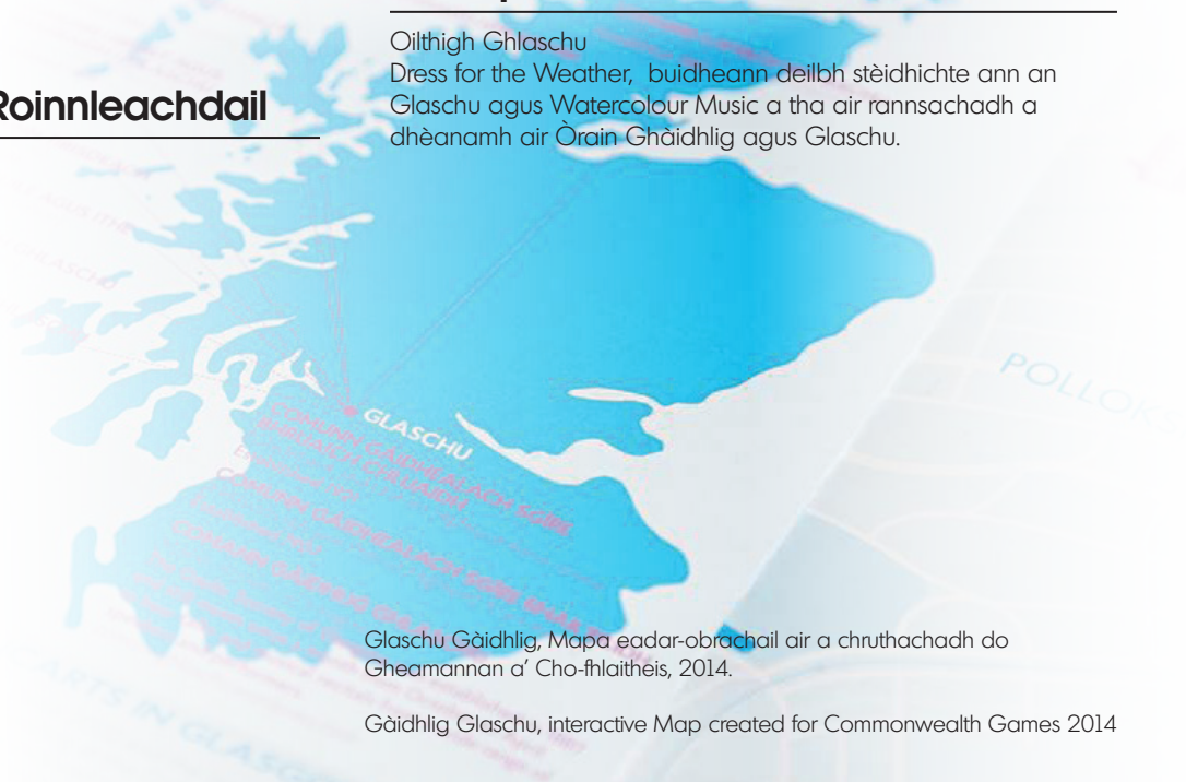
Glaschu Gàidhlig, Mapa eadar-obrachail air a chruthachadh do Gheamannan a’ Cho-fhlaitheis, 2014.

Oilthigh Ghlaschu Dress for the Weather, buidheann deilbh stèidhichte ann an Glaschu agus Watercolour Music a tha air rannsachadh a dhèanamh air Òrain Ghàidhlig agus Glaschu.