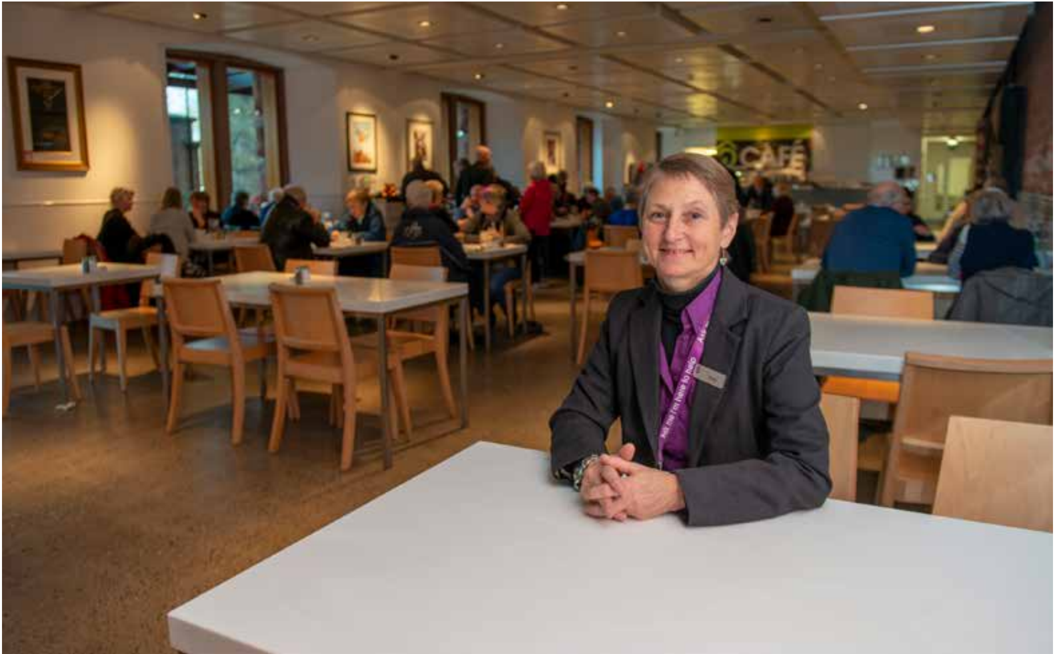
You can get table service and hot meals in the KG Café.