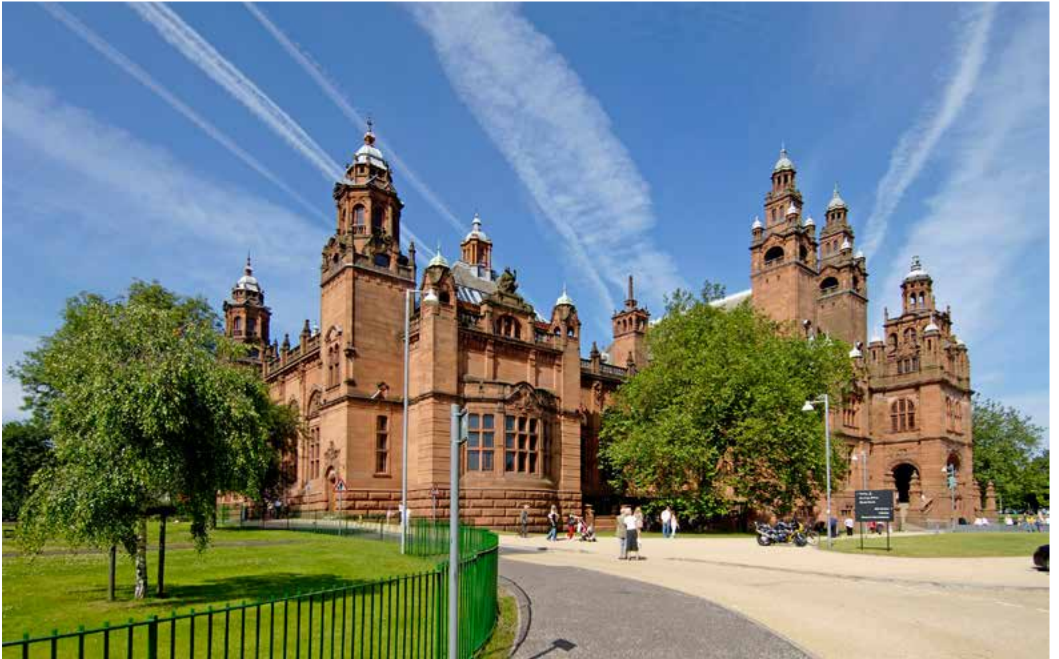
This is Kelvingrove Art Gallery & Museum.