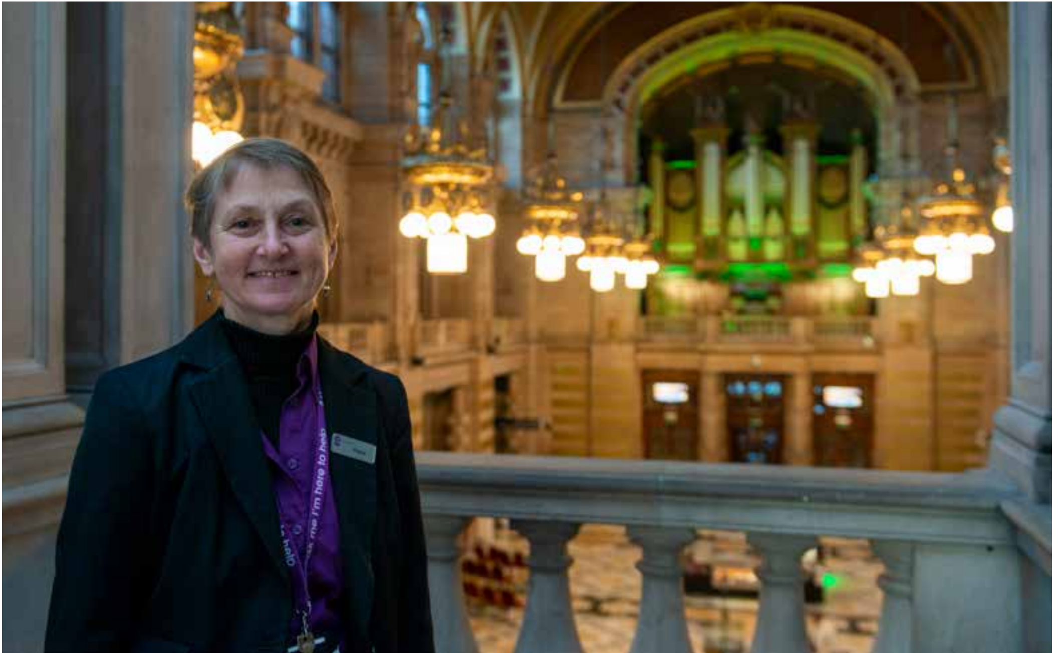
You can stand on the balconies and look down over the Centre Hall.