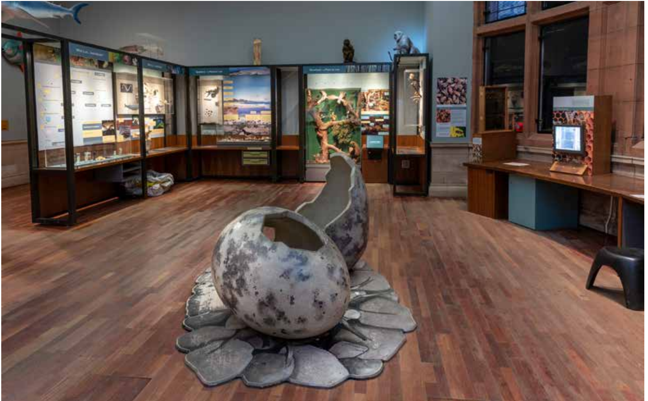
Children can learn and play in the Environment Discovery Centre.