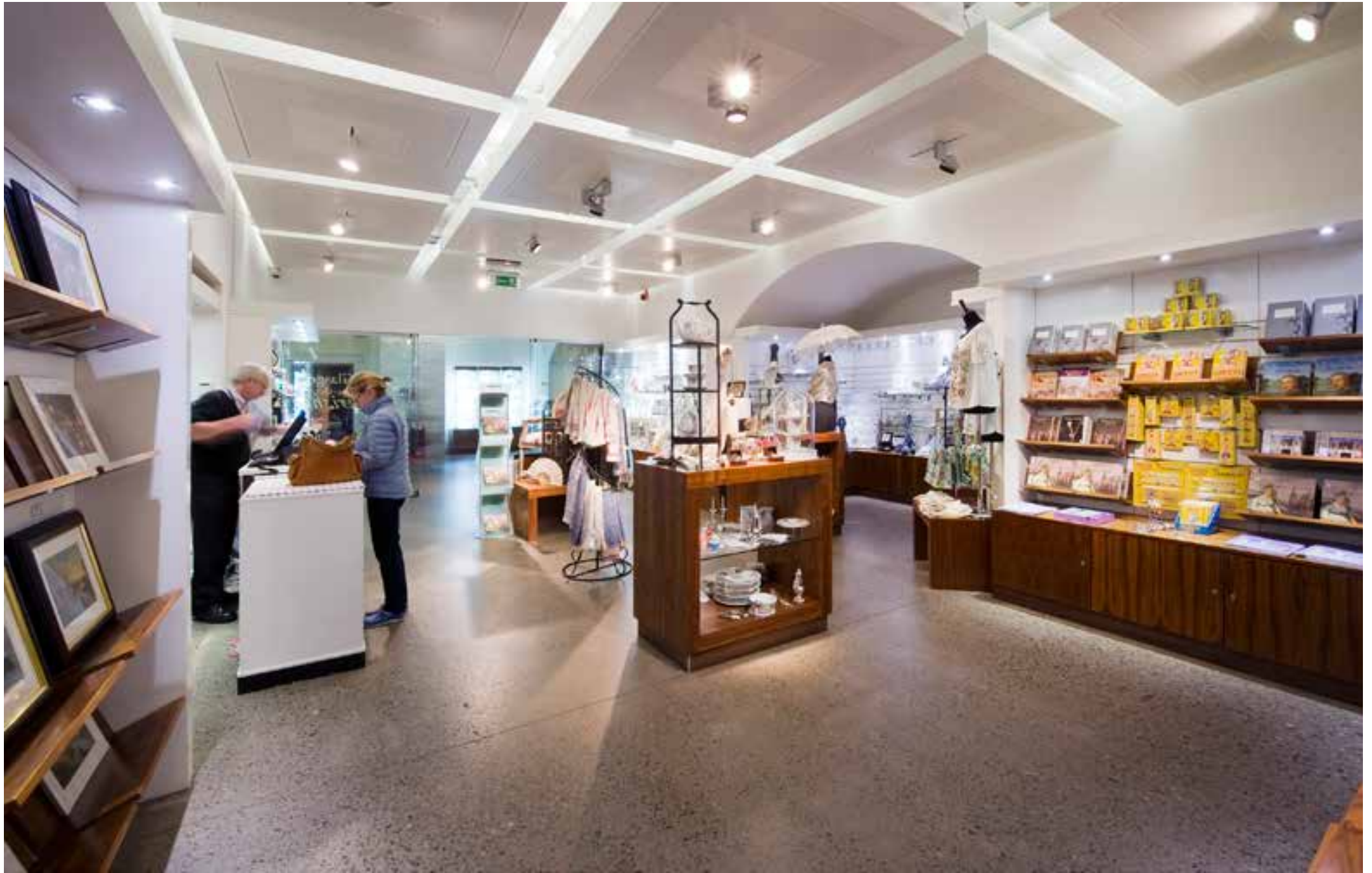
You can buy gifts in the museum shops.