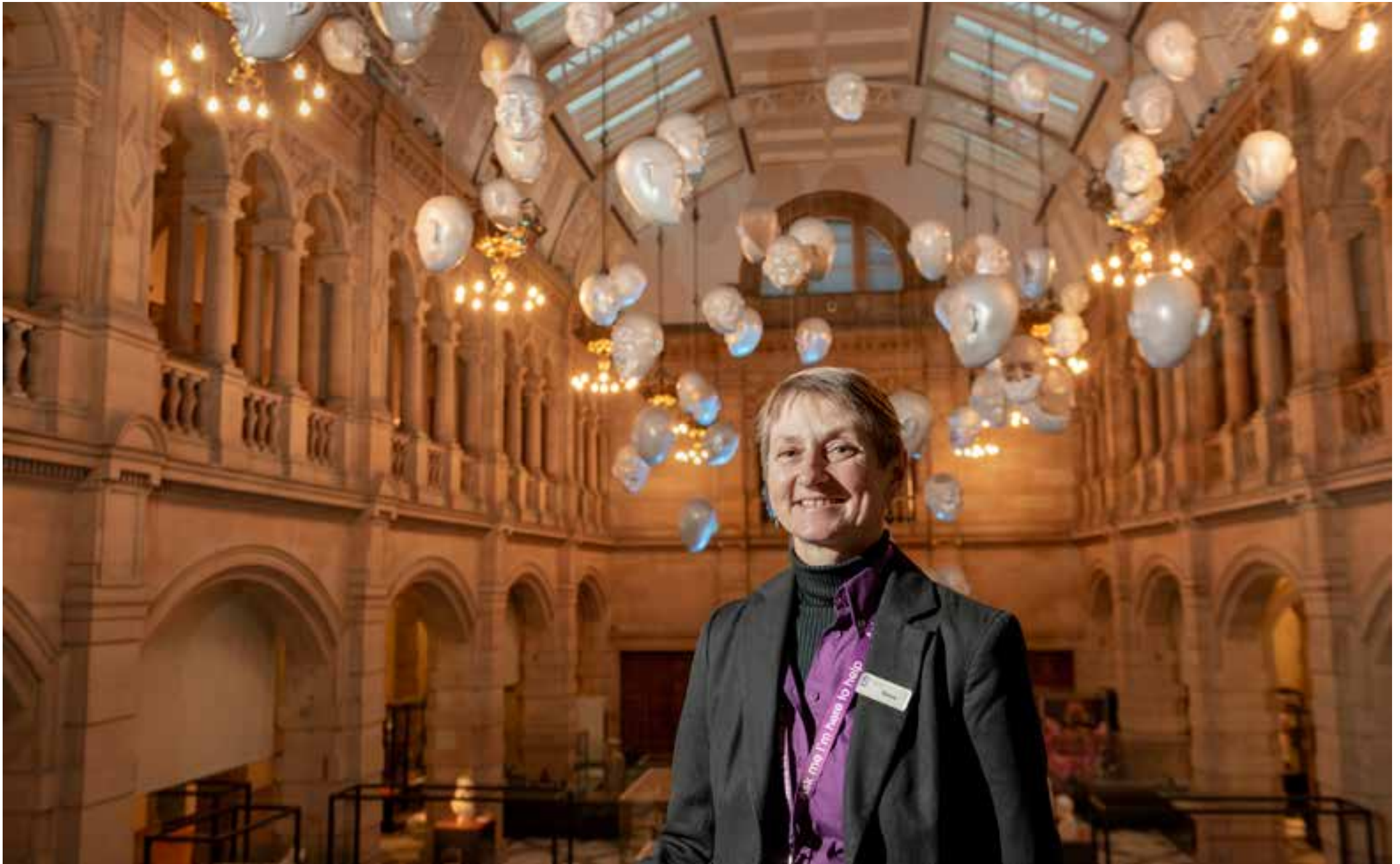
This is the East Court on the ground floor. You can see objects in cases, art work on plinths and art work hanging from the ceiling. The art work is fragile so do not touch.