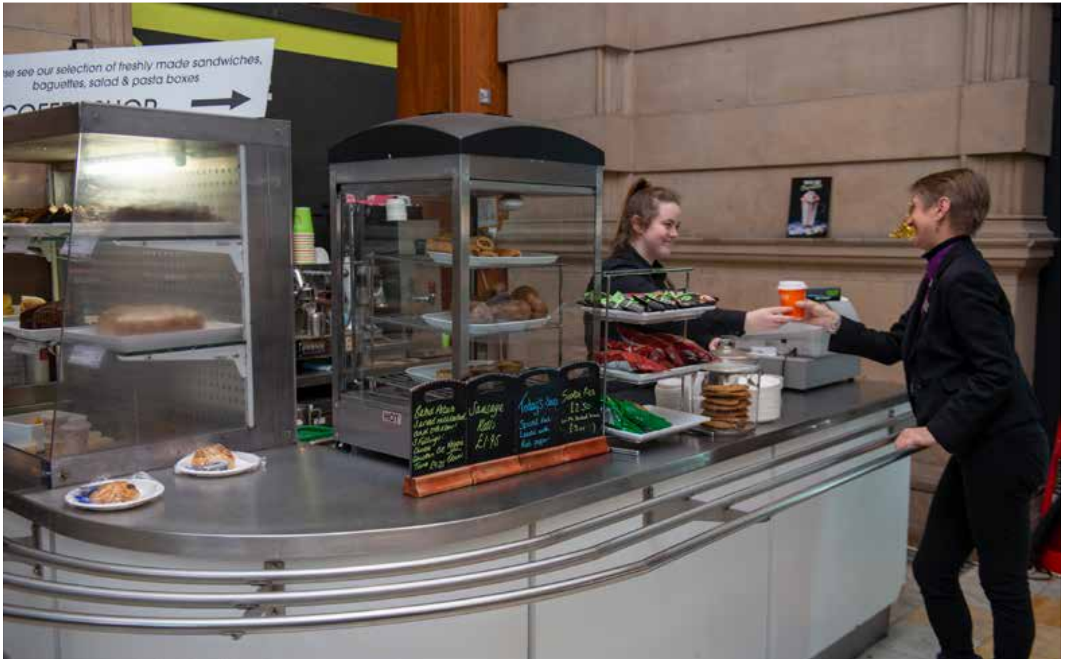
This is the KG Coffee Shop. You can queue up to buy sandwiches and coffee at the Coffee Shop.