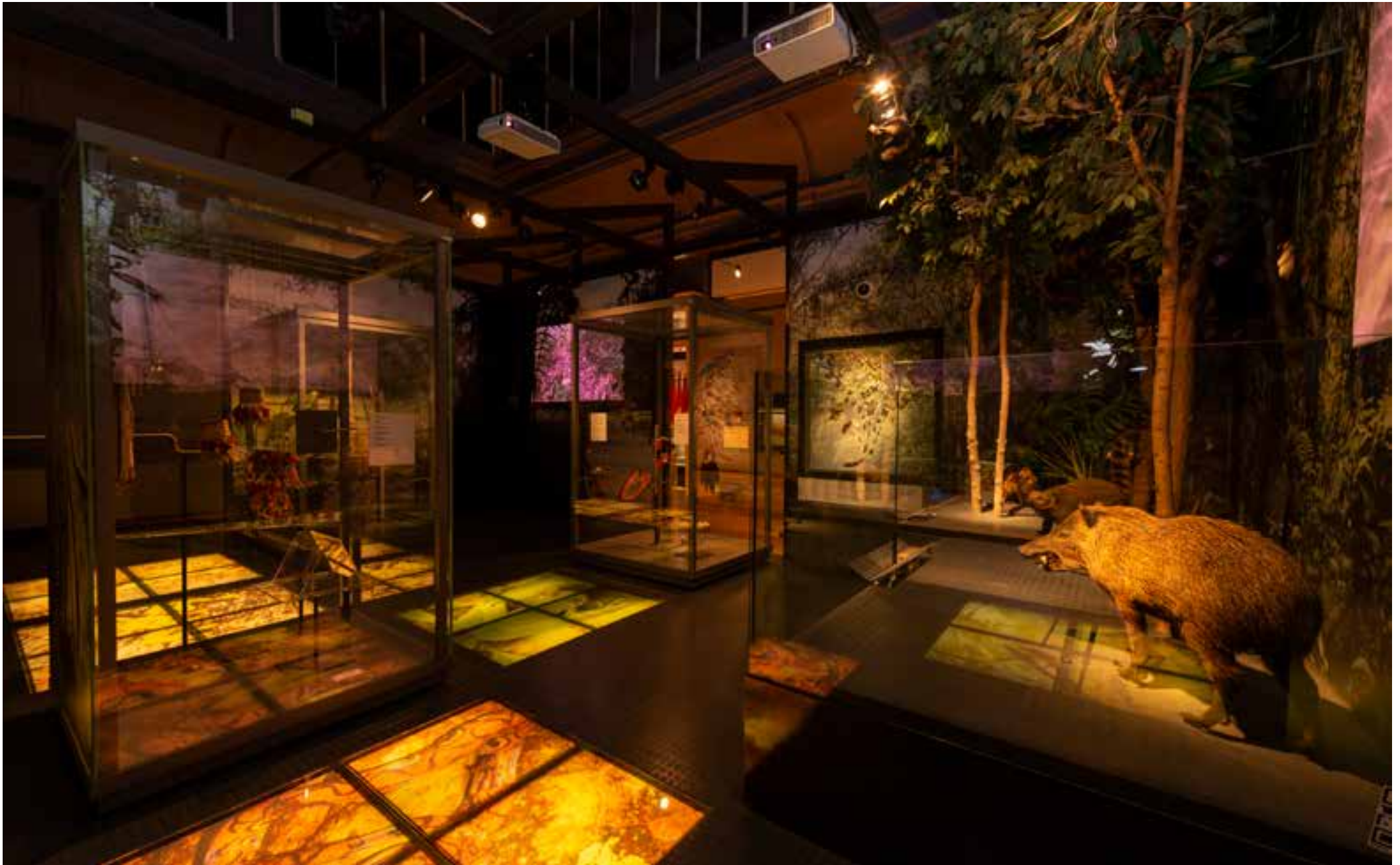
The Object Cinema: Life in the Rainforest. This room is dark. There are lightboxes on the floor. You can watch a film. You can hear sound effects such as music, animals and a chainsaw.