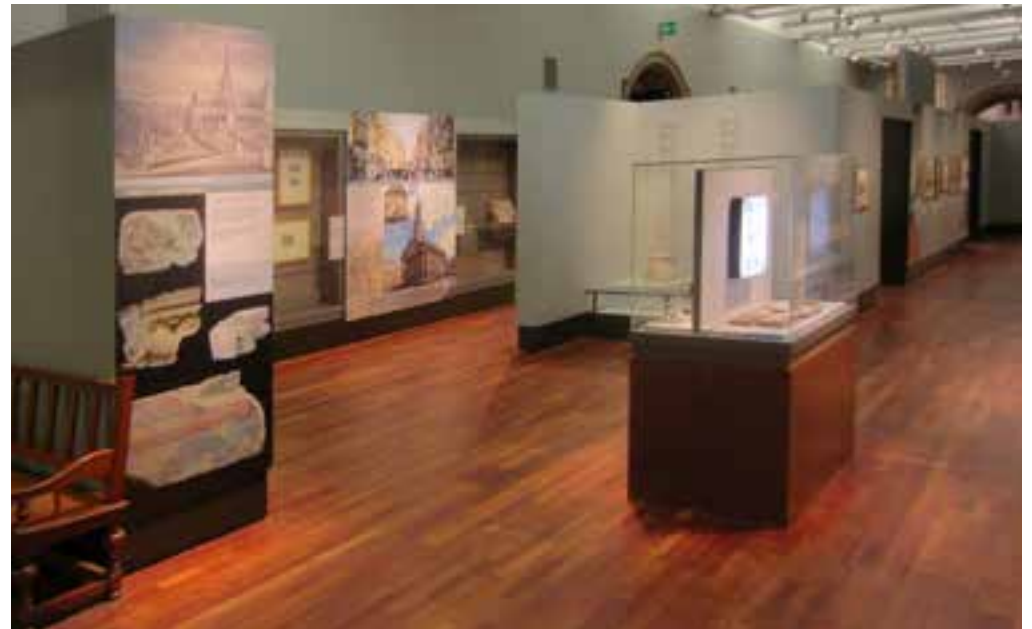
These are the galleries off the West Court. Scotland's Wildlife. Creatures of the Past. Ancient Egypt. Glasgow Stories.