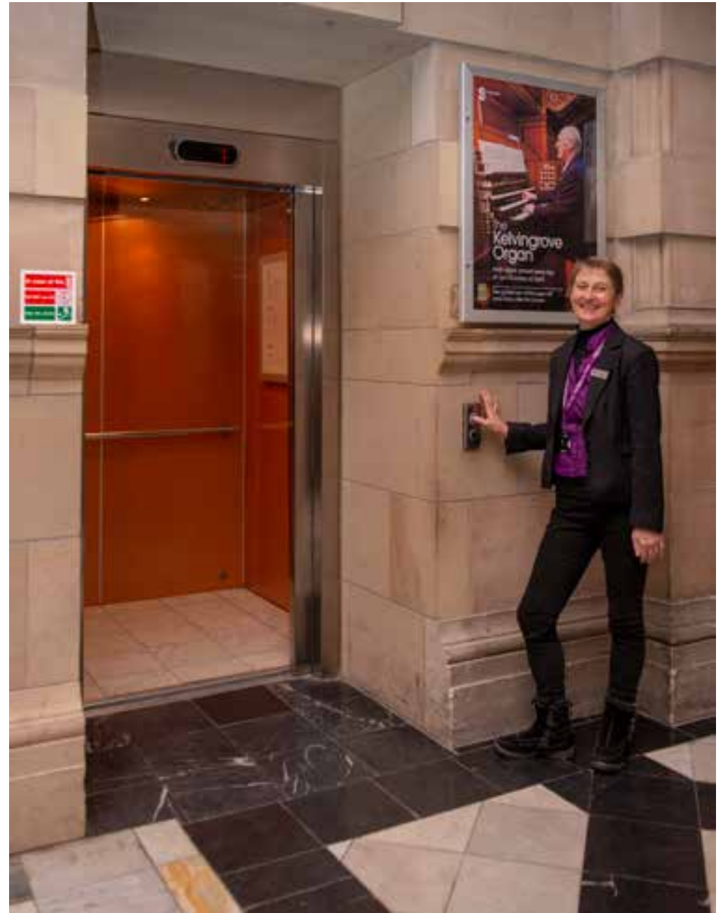
There are toilets on every floor. There are lifts and stairs between the three floors of the museum.