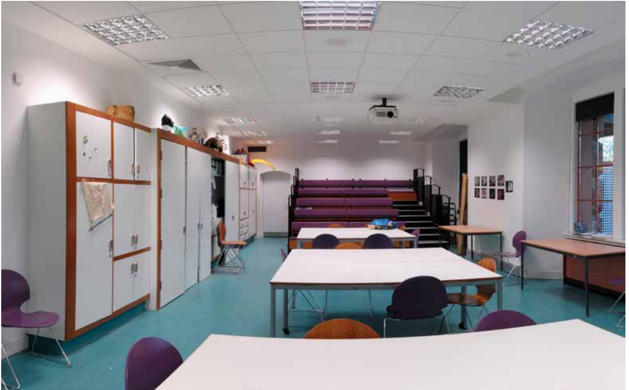
This is the education suite. Schools visit this space with a learning assistant. Sometimes this space is closed.