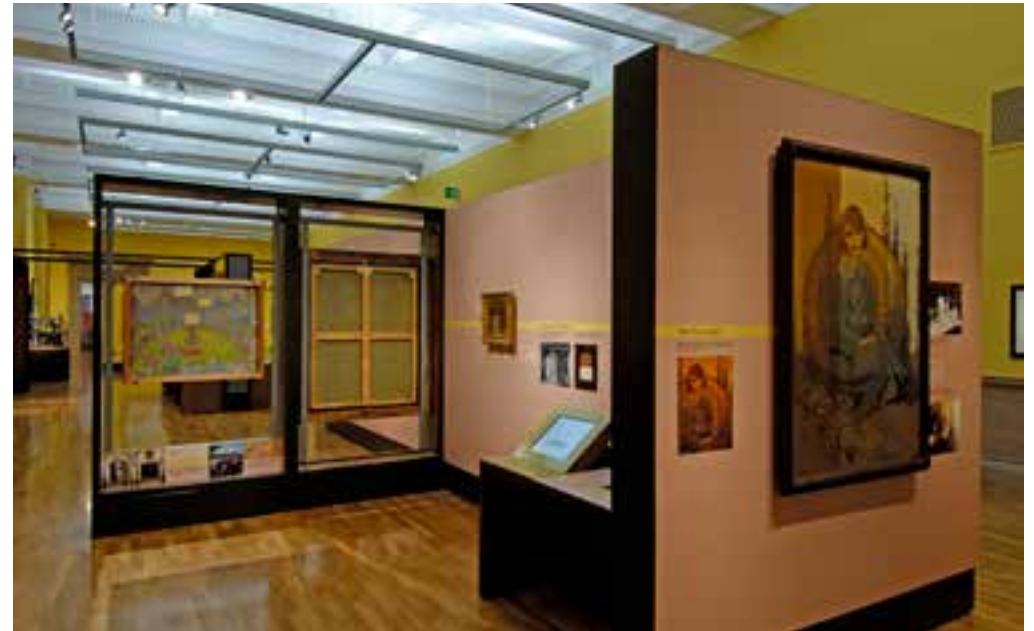
These are the galleries off the East Court. The Glasgow Boys. Looking at Design. Mackintosh and the Glasgow Style. Looking at Art.