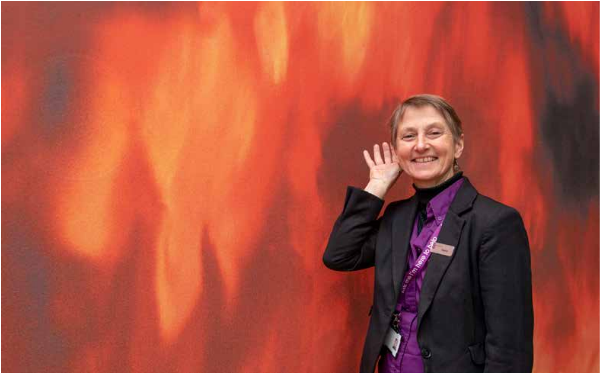
Scotland's First Peoples Gallery. You can hear voices telling stories and sound effects such as fire crackling.