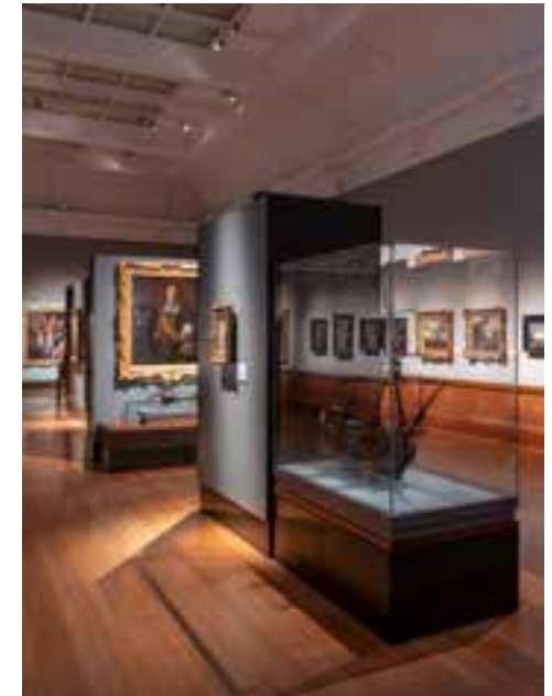
This is the first floor. These are the galleries up above the East Court. Scottish Identity in Art. Every Picture Tells a Story. French Art. Scottish Colourists. Dutch Art.